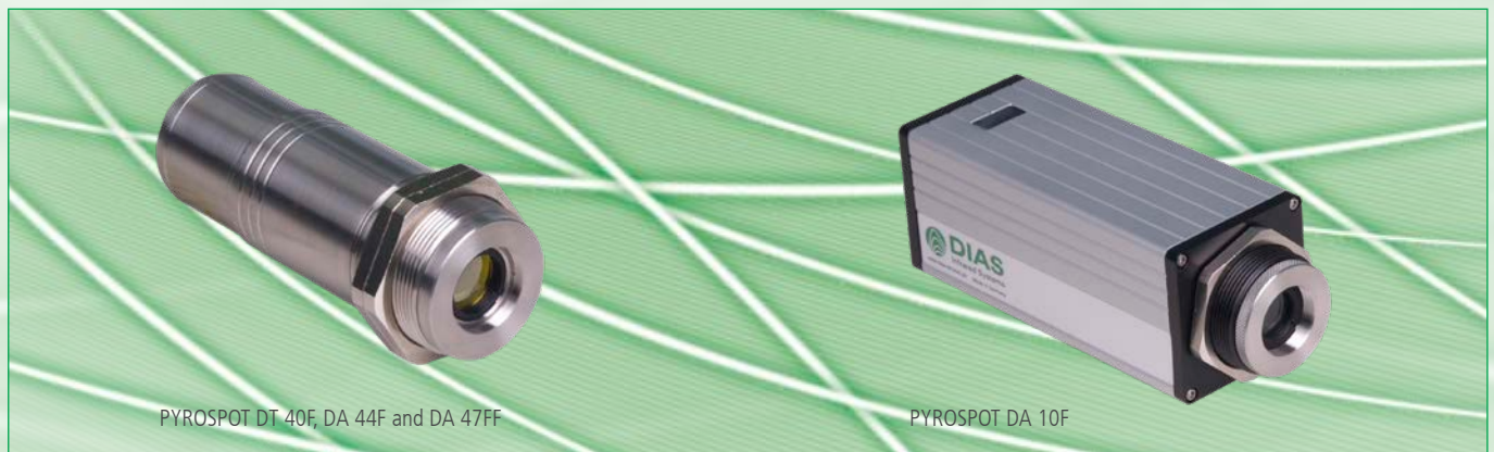
PYROSPOT DT 40F, DA 44F and DA 47F

All pyrometers have a standard analogue output available or a digital interface for integration in the process control.