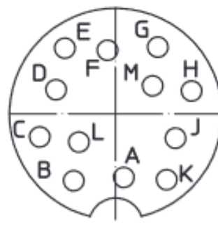
M16 / SV120-12p. (Lumberg)